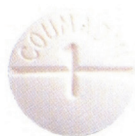
Light tan 1mg